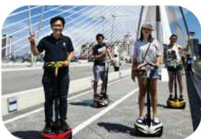
Over 10 Interactive activities & Excursions