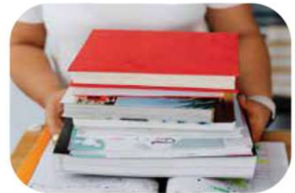
Book & Learning materials