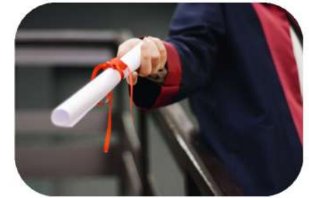
Closing lunch ceremony with certificates & photo session