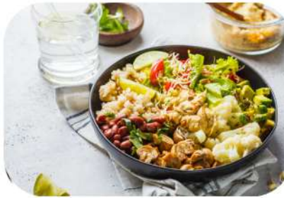
Daily lunch provided (excluding weekends)