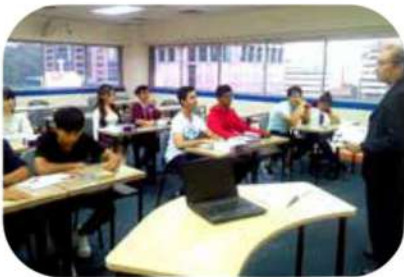
80 hours English language Classes