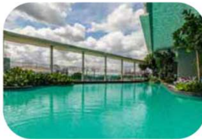
4 Star accommodation